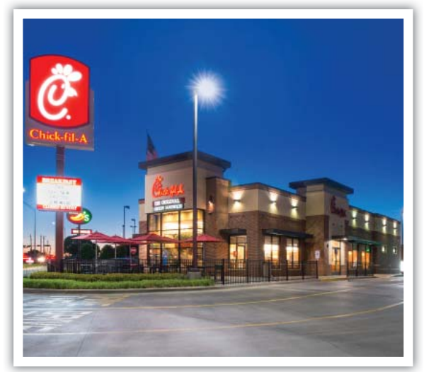
Now Open: Chick-fil-A

Sun Valley Square, formerly known as the Sun Valley Motor Hotel property, is currently home to Chick-fil-A (opened in 2015) with Jimmy John's and AT&T taking tenancy in Fall 2017. Two parcels remain available for sale, ground lease, or build-to-suit. Located on S. 77 Sunshine Strip with average annual daily traffic counts of over 32,000 (TxDOT 2015) and in close proximity to Valley Baptist Medical Center, this site is a perfect location for medical, retail, restaurant, and/or hospitality.